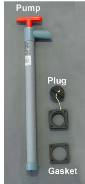
Pump system components