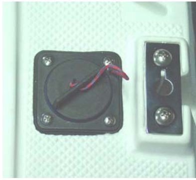
Pump Hatch, Closed